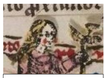
Woodcut print of a maiden, glued into the Latin-Low German Prayerbook Bodleian Library, MS. Lat. Liturg. f. 4, fol. 141v