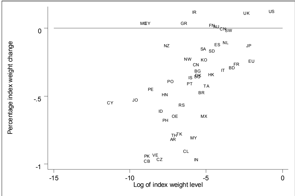
Figure 1: The percentage weight change of a country in the MSCI ACWI index is plotted against the log level of the country's weight prior to the index redefinition. The sample countries are Australia (AU), Brazil (BR), Canada (CN), Chile (CL), China (CB), Colombia (CT), Czech Republic (CZ), Denmark (DK), Egypt (EY), Hong Kong (HK), Hungary (HN), India (IN), Indonesia (ID), Israel (IS), Japan (JP), Jordan (KN), Korea (KO), Malaysia (MY), Mexico (MX), Morocco (MC), New Zealand (NZ), Norway (NW), Pakistan (PK), Peru (PE), Philippines (PH), Poland (PO), Russia (RS), Singapore (SG), South Africa (SA), Sri Lanka (CY), Sweden (SD), Switzerland (SW), Taiwan (TA), Thailand (TH), United Kingdom (UK), United States (US), Venezuela (VE), and the Euro Area (EU).