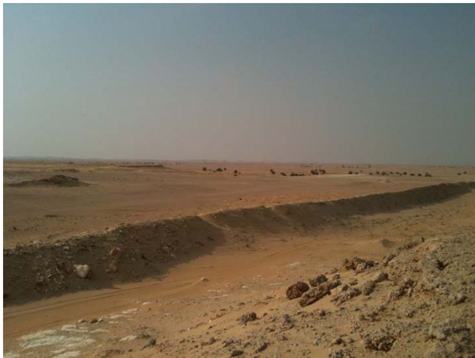
Fig 2: PSG I9 : View of bank surrounding restricted military area