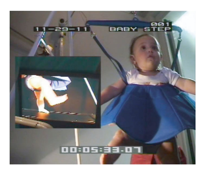
Figure 2 Experimental setup during the training phase of the experiment. Infants were placed in a baby bouncer while they were supported over the infant treadmill by the experimenter. Infants either saw their own leg movements online or another infant's previously recorded leg movements on a 51-inch plasma screen. Infants wore a skirt to prevent them from receiving correlated visuomotor experience by looking down at their own legs.

received. All infants wore a tutu-like skirt to prevent them from receiving correlated visual feedback by looking down at their own legs (see Figure 2). To motivate the infants to look at the screen, music would play only if the infant attended to the screen. If the infant failed to look at the screen, the experimenter triggered the presentation of brief attention-getting sounds to attract the infant's attention. The duration of the training session depended on how long the infant continued to perform stepping movements and watch the stimuli. The second training session was identical to the first and took place approximately 24 hours later. The second training session was followed by the post-test phase after a short 5-minute break.