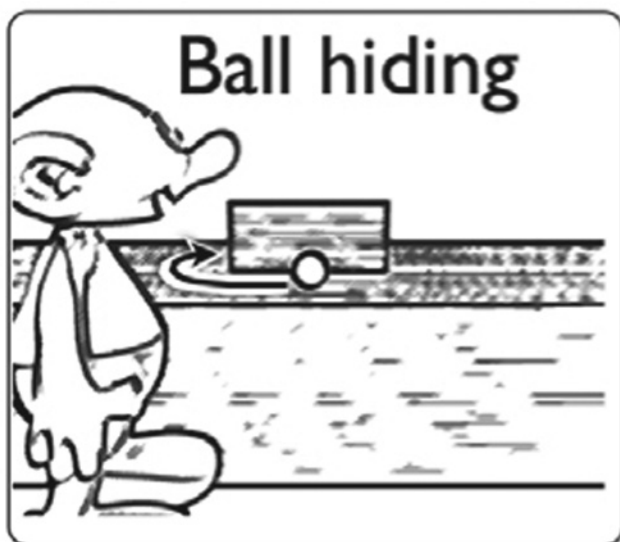
Fig. 3. An example of the stimuli used in the Smurf test of false belief attribution. Reprinted with permission from Kovács, Téglás, and Endress (2010).

The results of the other experiments in the series by Kovács et al. (2010) are also consistent with the submentalizing interpretation. In Experiment 2, the critical result was replicated when in all conditions a pile of boxes took the place of the Smurf in Phase 3. Thus, in this experiment, as in Experiment 1, an abrupt visual onset—appearance of the boxes—of the kind that is known to be especially effective in grabbing attention and thereby causing retroactive interference (Egeth & Yantis, 1997) occurred immediately after the last ball movement in the P-A+ condition but not in the P-A- condition. In Experiment 3, the critical result was not observed. A pile of boxes replaced the Smurf in all phases of this experiment, and it was continuously present; it did not disappear in Phase 2 and reappear in Phase 3. Consequently, there was no event in any condition likely to cause