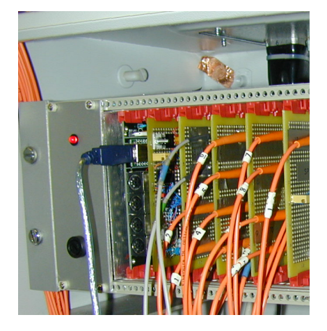
Figure 4: The linac fibre-optic transmitters / receivers handling timing data in and out of ther Faraday cage.

This work is licensed under the Creative Commons Attribution-NonCommercial-NoDerivs 3.0 Unported License. To view a copy of this license, visit <u>http://creativecommons.org/ licenses/by-nc-nd/3.0/</u> or send a letter to Creative Commons, 444 Castro Street, Suite 900, Mountain View, California, 94041, USA.