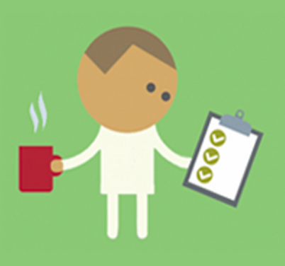
Follow health guidelines