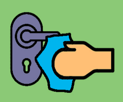
Clean padlocks, keys, and door handles