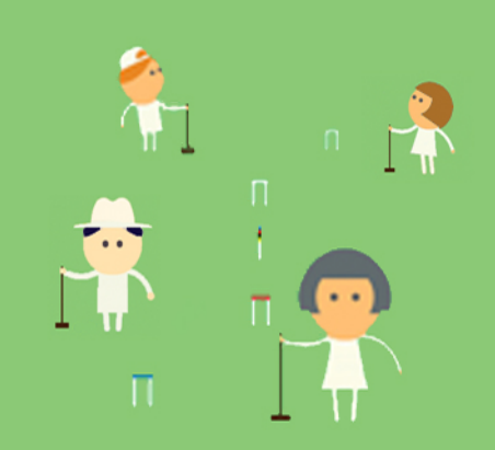
Max 4 people per lawn (if not from the same household)