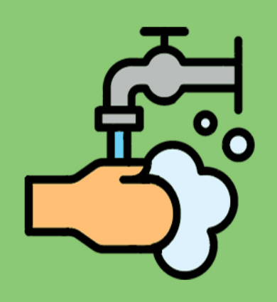
Wash your hands, and any equipment you use