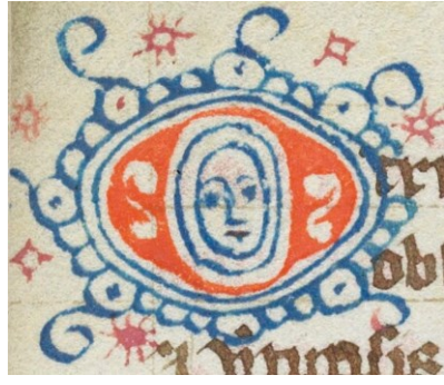
Bodleian Libraries Oxford MS. Lat. liturg. f. 4, fol. 31r

Thursdays of even weeks, 3pm-4pm, Lincoln College (Lower Lecture Room)