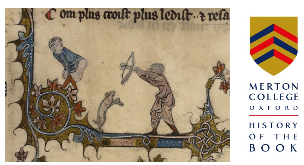
Bodleian Library MS Bodley 264, fol. 3r detail

The splendidly-illuminated Bodley Alexander, which makes up the first and most substantial part of Oxford, Bodleian Library MS Bodley 264 is one of the most celebrated and delightful books to survive from late medieval Europe. Through a new reading of the bas-de-page scenes and the detection of an embedded game hidden within the decorative programme, this talk presents evidence that the book was made for a young prince. The book can thus be regarded not only as a multimodal speculum principis for a boy, but a medieval version of a modern picturebook genre for children, the search-and-find book.