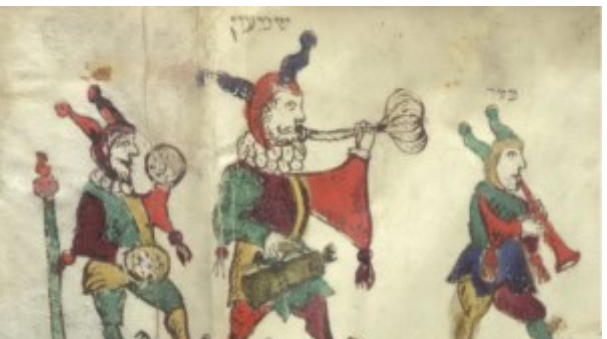
The British Library (MS Or. 1047, fol. 2r)