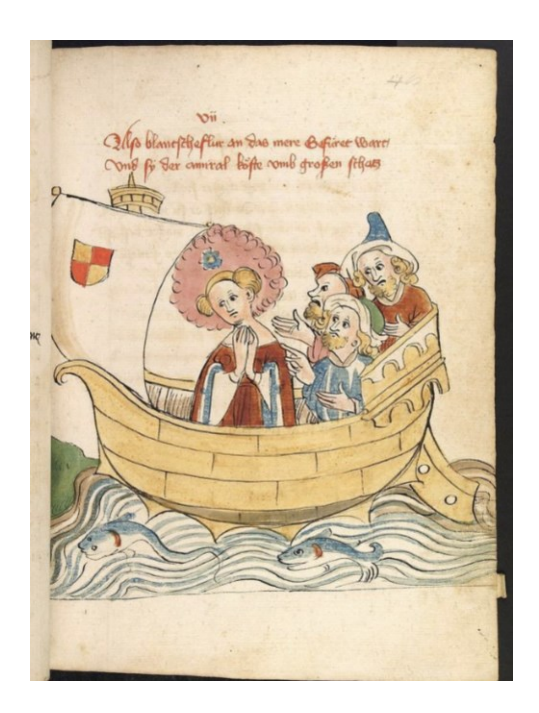
Image: Blancheflur at sea, <u>UB Heidelberg cpg 362, fol. 48r</u> (Diebolt Lauber Workshop)

In week 1, we will have a shorter organisational meeting.