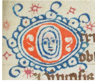
Bodleian Libraries Oxford MS. Lat. liturg. f. 4, fol. 31r