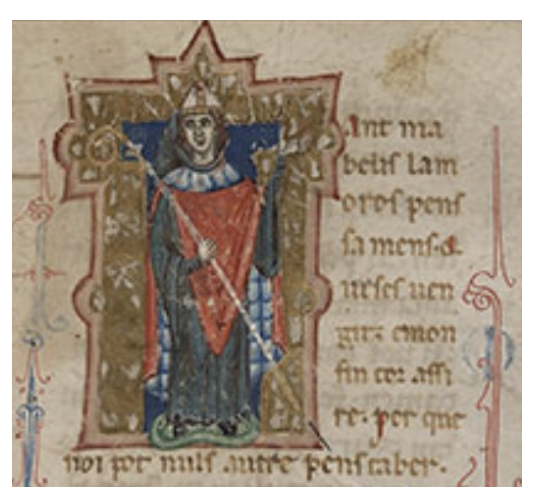
M. 819, f.55r. Pierpont Morgan Library,

The Old Occitan reading group welcomes anyone interested in reading and researching texts in Old Occitan. The group will provide practice for both beginners and returning readers of Old Occitan texts.