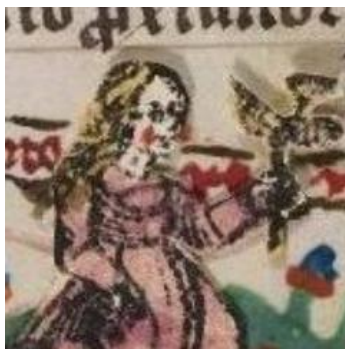
Woodcut print of a maiden, glued into the Latin-Low German Prayerbook Bodleian Library, MS. Lat. Liturg. f. 4, fol. 141v