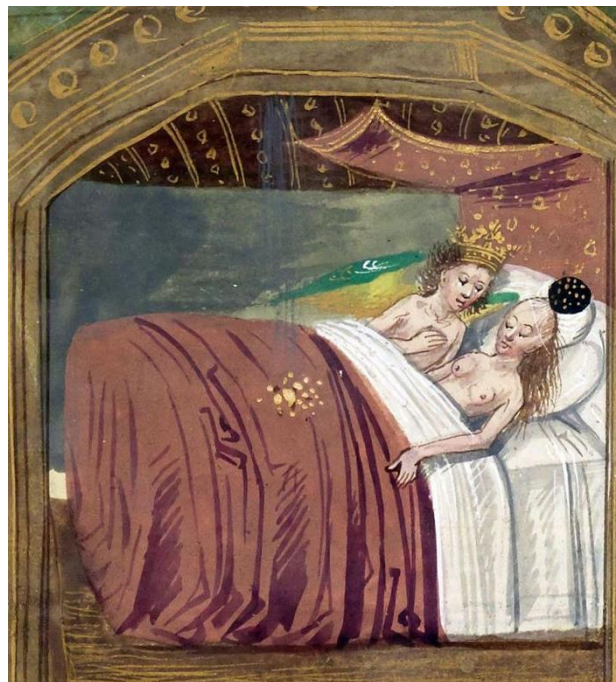
Jupiter visits Danae (from a French Ovid manuscript at Bruges)