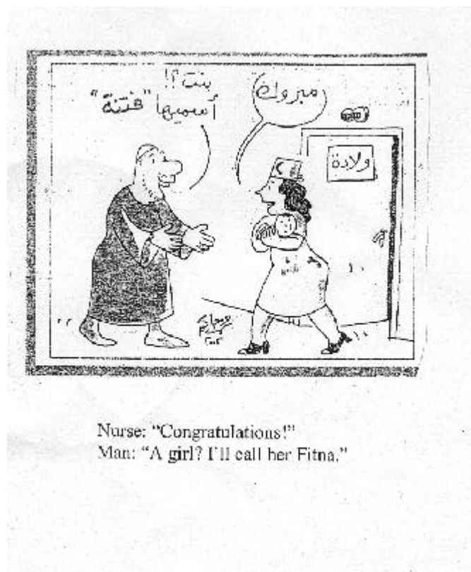
Nurse: "Congratulations!" Man: "A girl? I'll call her Fitna."